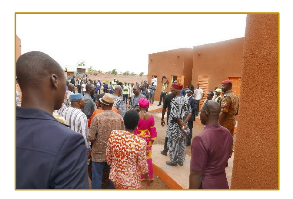
Burkina Faso government officials and delegates, local communities and community leaders visit the RAP houses

"Following a few speeches, marked by the blessing of the Mayor for the success of the Project, the Prime Minister started a bulldozer as the symbolic first shovel of the RAP construction. During the ceremony, the homes constructed to date in the resettlement areas as part of the RAP were visited and inspected with all parties very pleased with the workmanship of the local contractors."