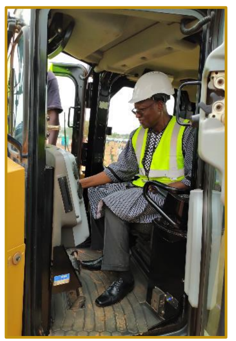
Burkina Faso Prime Minister, H. E. Christophe Dabiré starts the ceremonial bulldozer as a symbolic first shovel of the RAP construction